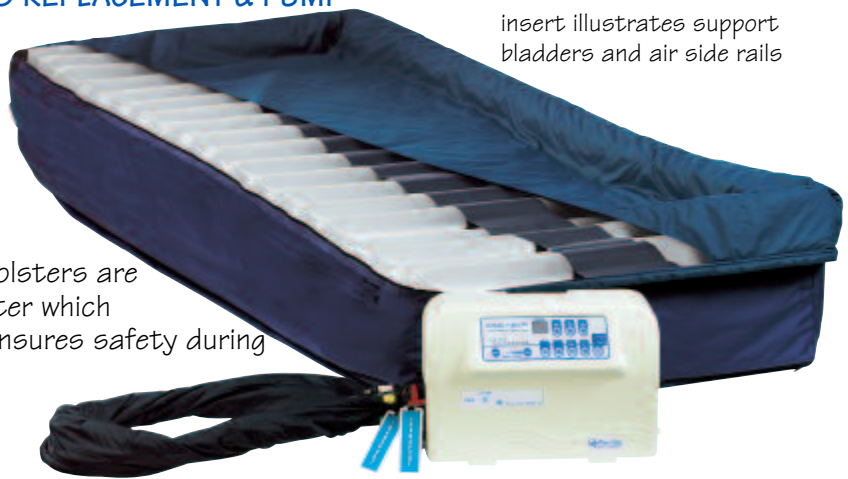
insert illustrates support bladders and air side rails

Mattress Cover: Vyvex-III® - Urethane coated, multi-stretch, low shear, moisture vapor permeable, quilted, removable, zippered cover, is anti-microbial and meets Cal. Tech. #117 for fire-retardancy.