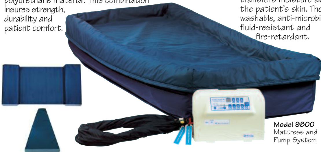
Model 9800 Mattress and Pump System

Vyvox - III® - Urethane coated, multi-stretch, moisture-resistant / vapor-permeable, low shear, quilted cover, transfers moisture away from the patient's skin. The cover is washable, anti-microbial, fluid-resistant and fire-retardant.