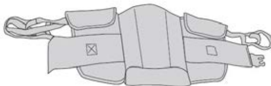
Sit to Stand Sling