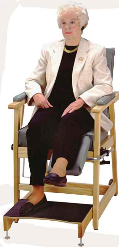
ASCENDER 300 Ultra Hip with Leg Support

...this chair is only found on orthopedic wards