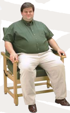
ASCENDER M.P. 500