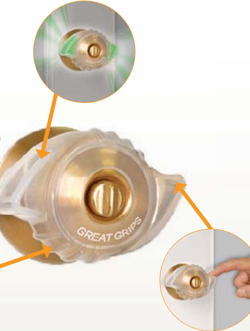
Open Door with Touch of Finger